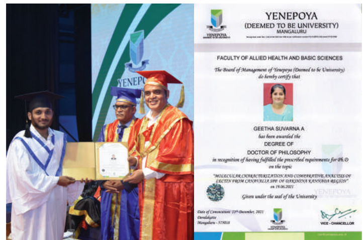
Convocation & Degree Certificate