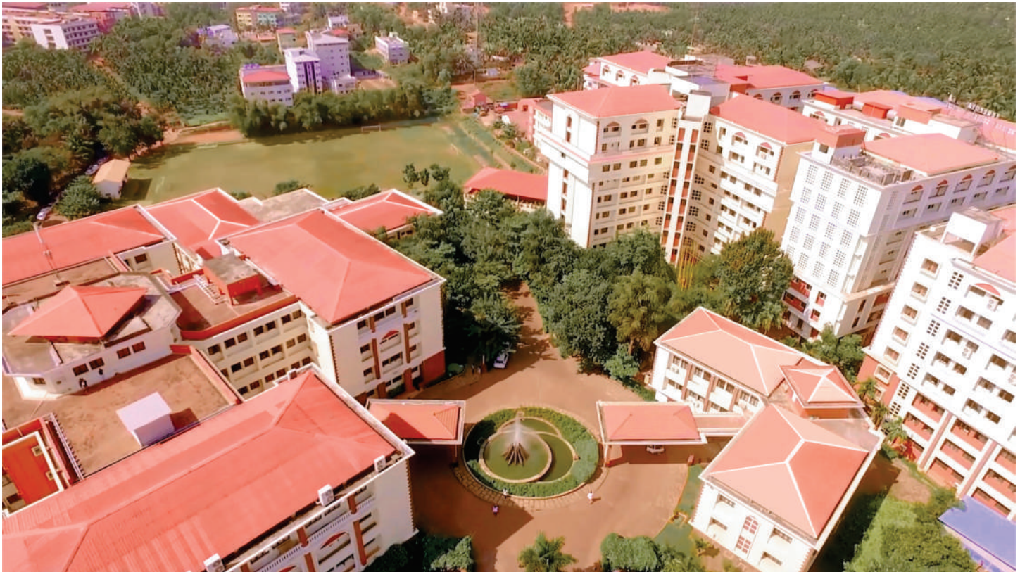
AERIAL VIEW OF YENEPOYA ( Deemed to be University )