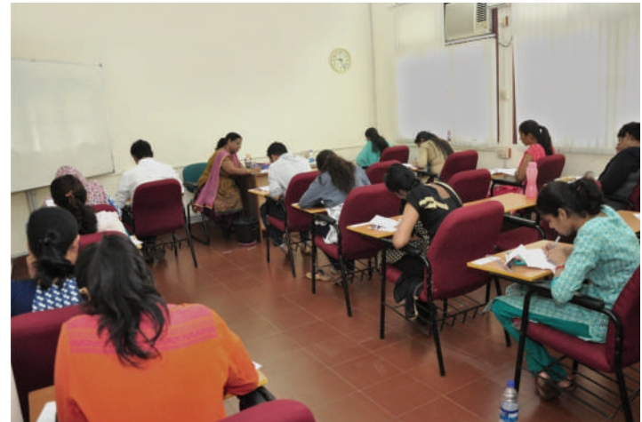
Pre Ph.D. Examination