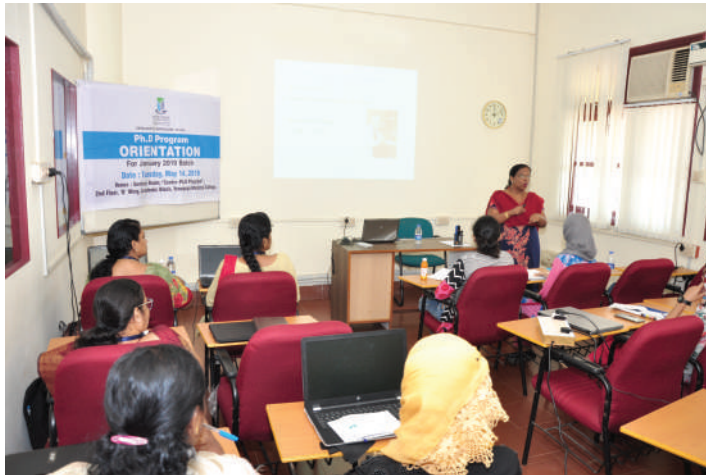
Ph.D. Program Orientation